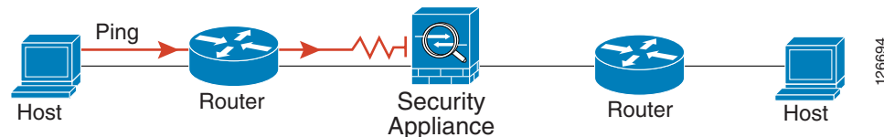
Figure 43-5 Ping Failure Because the Security Appliance is not Translating Addresses

Note The security appliance only shows ICMP debug messages for pings to the security appliance interfaces, and not for pings through the security appliance to other hosts.