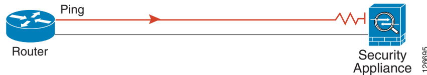
Figure 43-2 Ping Failure at Security Appliance Interface

If the ping reaches the security appliance, and the security appliance responds, you see debug messages like the following: